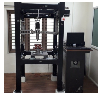
3-Axis Milling Machine (Parallel Kinematic Machine)