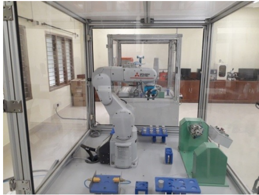
Industrial Robot Cell (Mitsubishi 6-axis Articulated Arm)