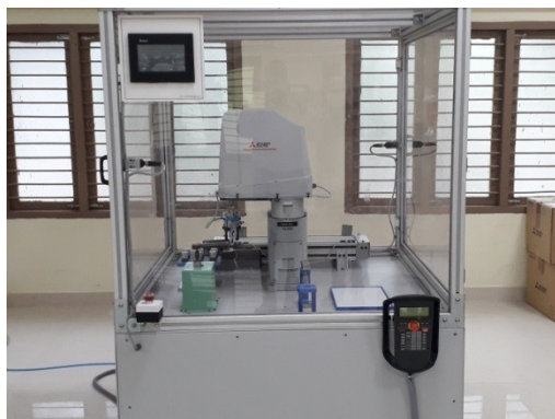
Industrial Robot Cell (Mitsubishi 4-axis, SCARA)