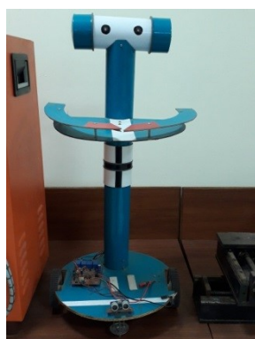
Wheeled Robo Servant