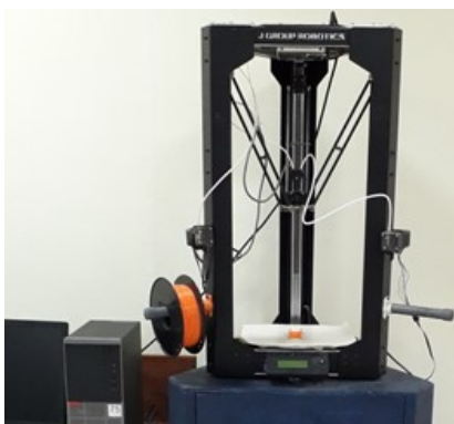
3D Printing DELTA (Parallel Robot)