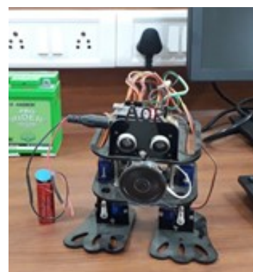
2-Legged Walking Robot