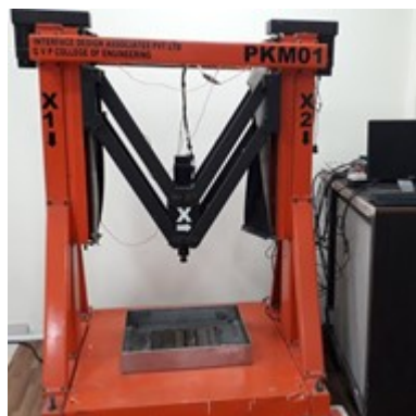
2-Axis Milling Machine (Parallel Kinematic Machine)